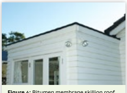
Figure 4: Bitumen membrane skillion roof