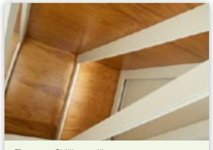
Figure 2: Skillion ceiling

Skillion roofs and very low pitched roofs typically have no way to access the cavity to insulate them unless the ceiling lining or the roofing is removed and replaced. However, at the point when the roof or ceiling lining is replaced the cavity will become accessible and, where insulation does not meet the requirements, must be insulated to the required standards as set out in the map of climate zones on page 10.