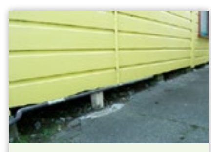
Figure 7: Areas of subfloor space with insufficient clearance

Areas of subfloor spaces that are too low to the ground for a professional installer to insulate safely are not required to be insulated until such a time as it becomes possible (e.g. when replacing floorboards, repiling).