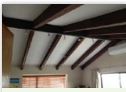
Figure 6: Skillion ceiling