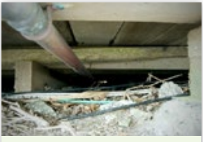
Figure 8: Areas of subfloor space with insufficient clearance